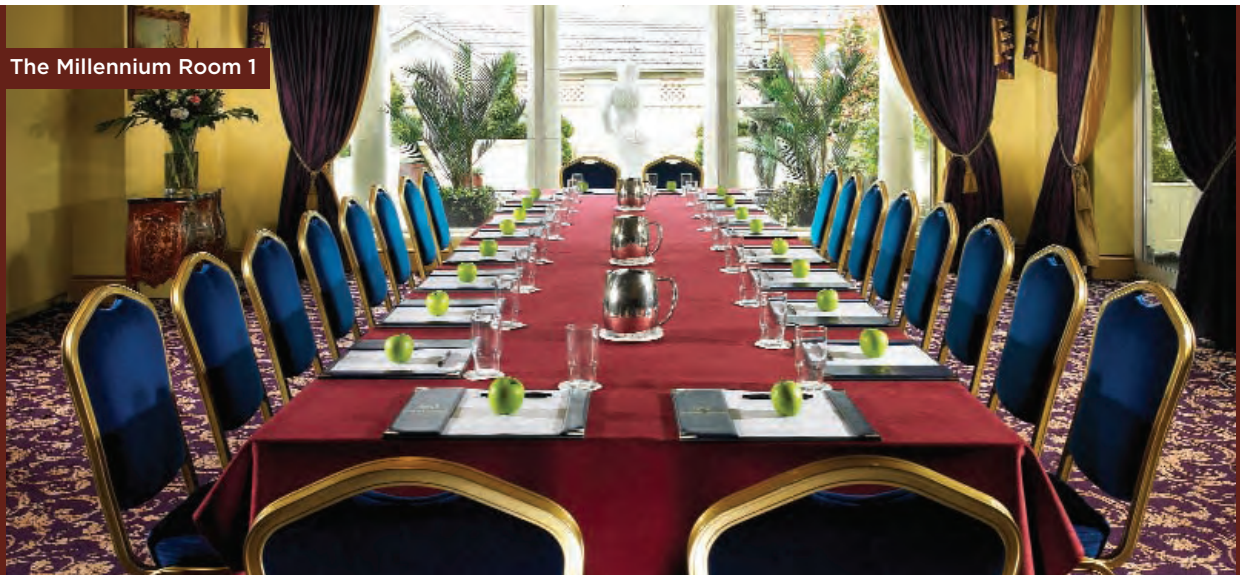
The Millennium Room 1