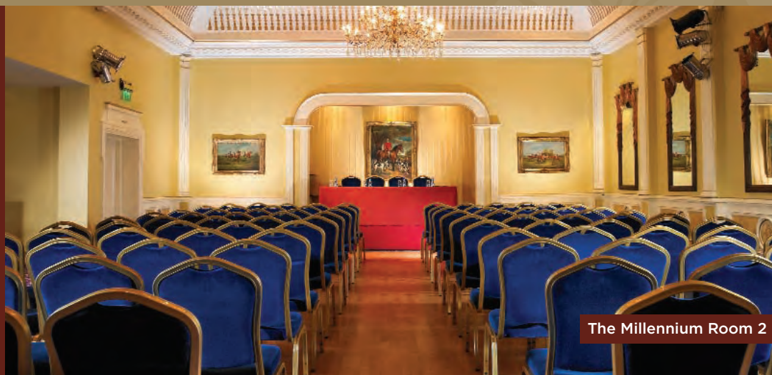
The Millennium Room 2