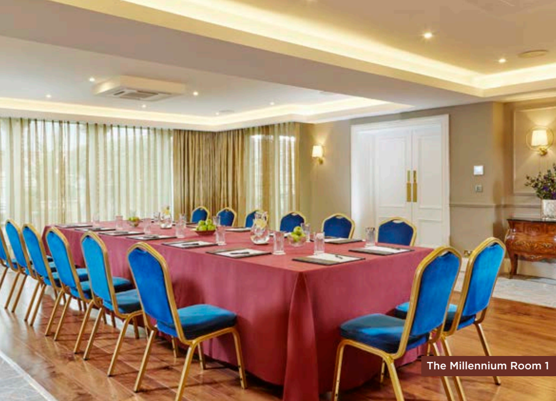
The Millennium Room 1

Traditional style in a contemporary setting