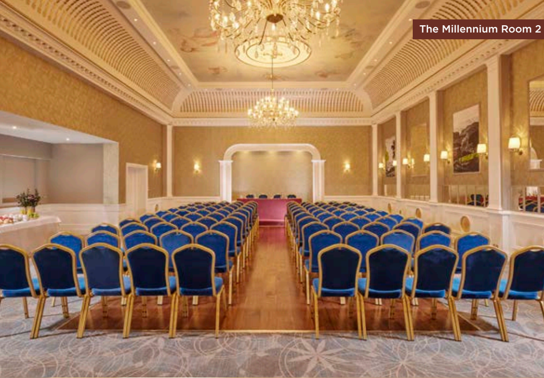
The Millennium Room 2